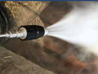
Ultra-Impact Nozzle 3000