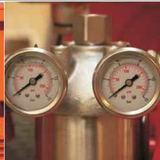
Filter Change Indicators