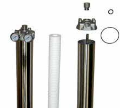
Strainers & Filtration