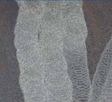
Water Blasting With Rotating Nozzles