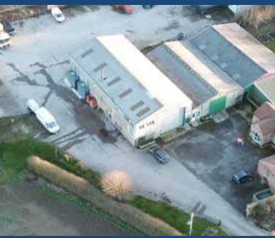
Hydroblast based in Yorkshire England