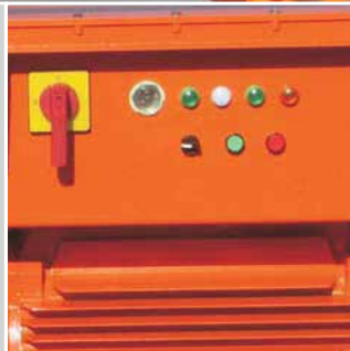
Built In Heavy Duty Electrical Box