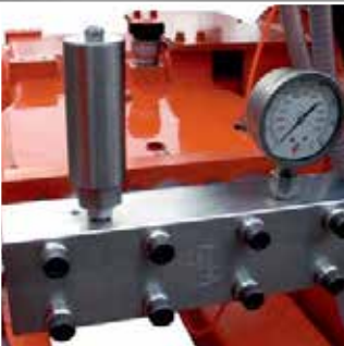
Stainless steel pump-head